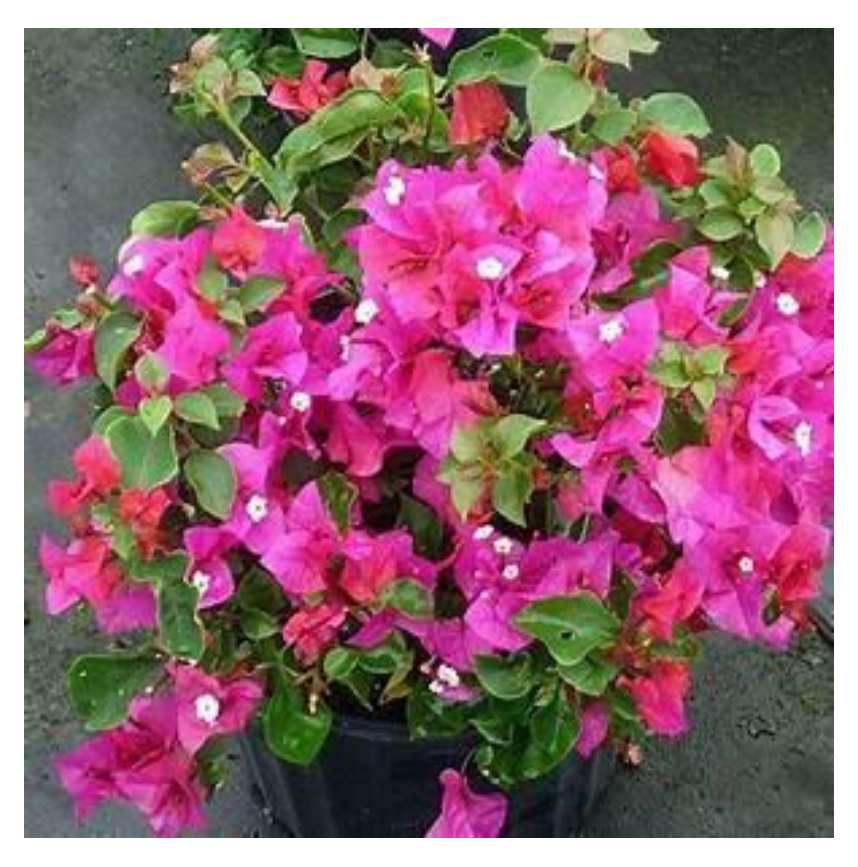
Bougainvillea 'Helen Johnson'

Botanical Name: Bougainvillea 'Helen Johnson'