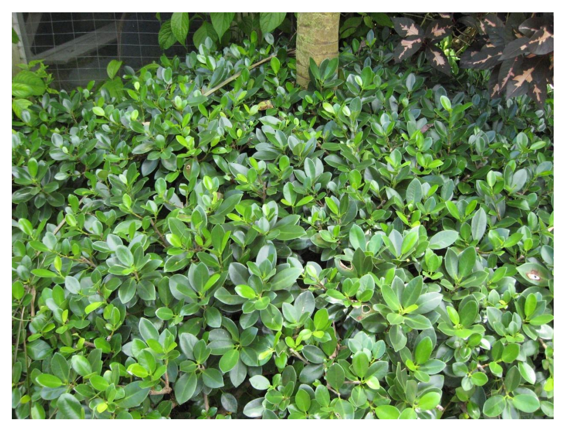
Green Island Ficus

Botanical Name: Ficus microcarpa 'Green Island'