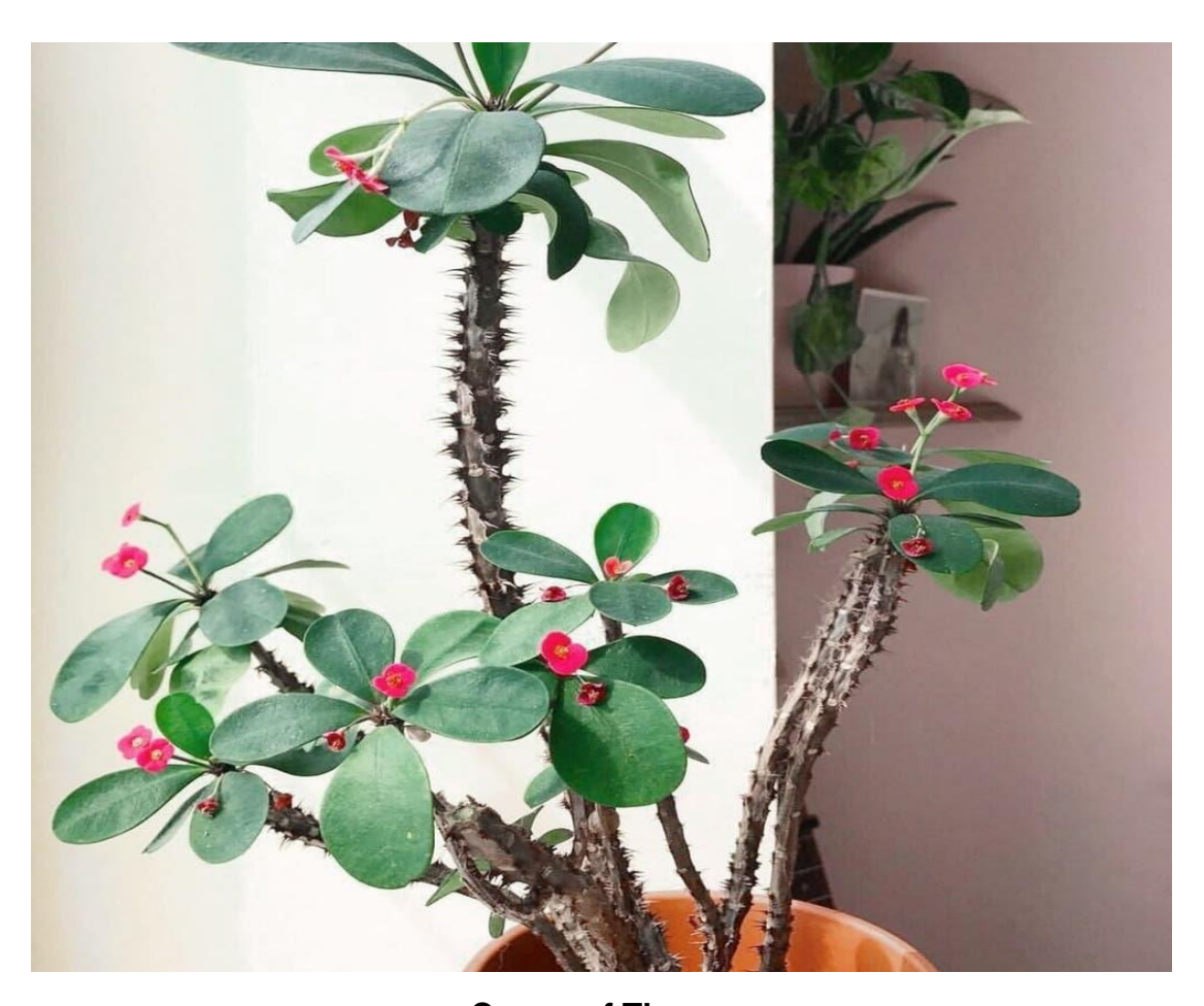
Crown of Thorns